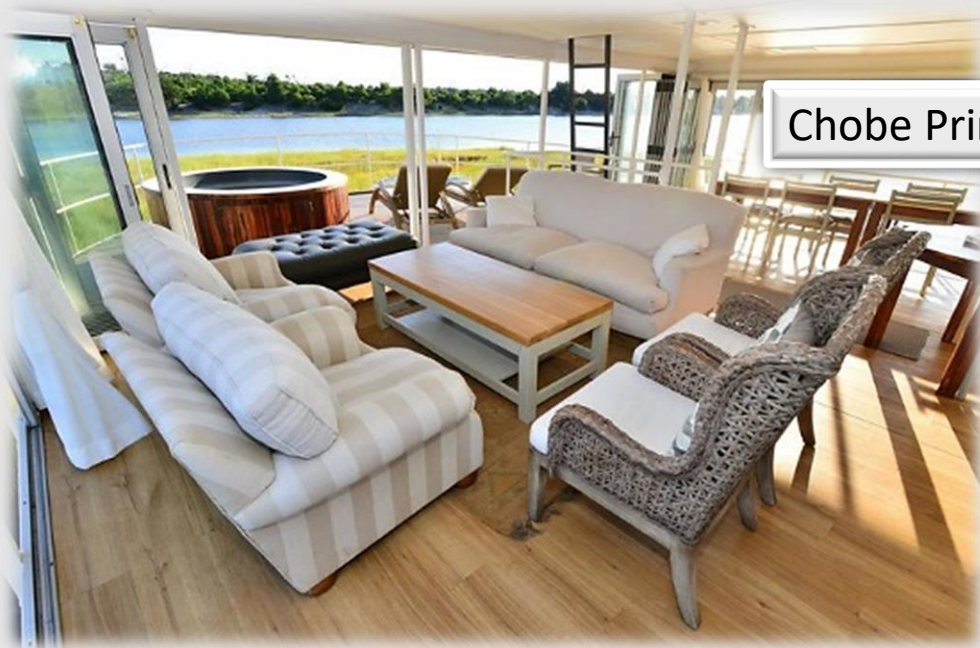
Chobe Princess House Boat